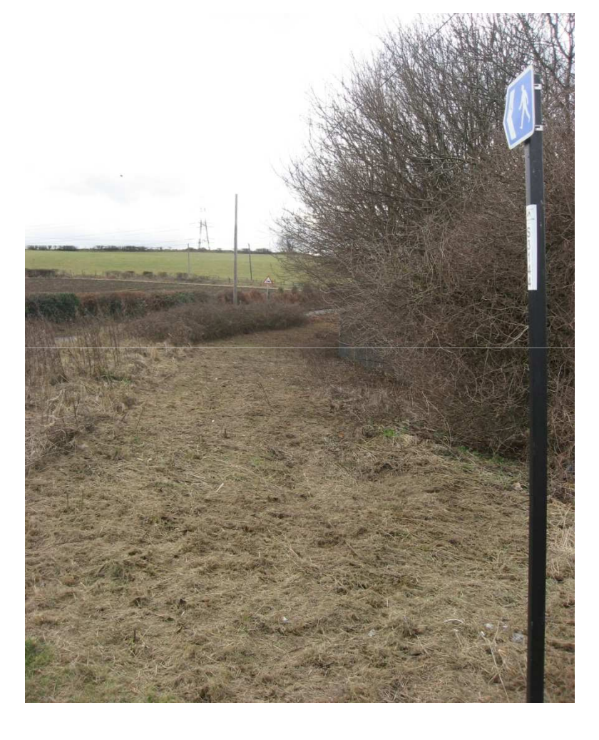
Use of verges at Thorpe Hesley