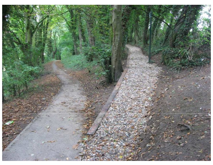
Path revetment at Laughton en le Morthen